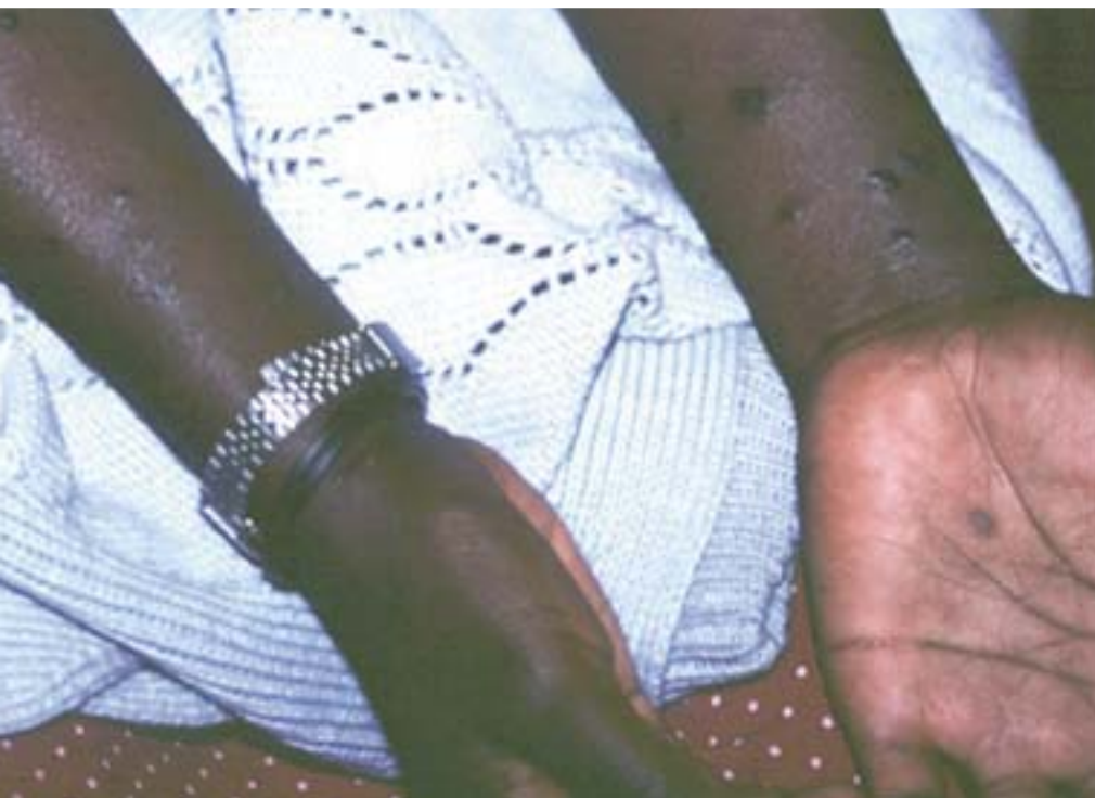
Symptoms of stage 2 syphilis. These dark marks developed after a rash which was not itchy or painful.