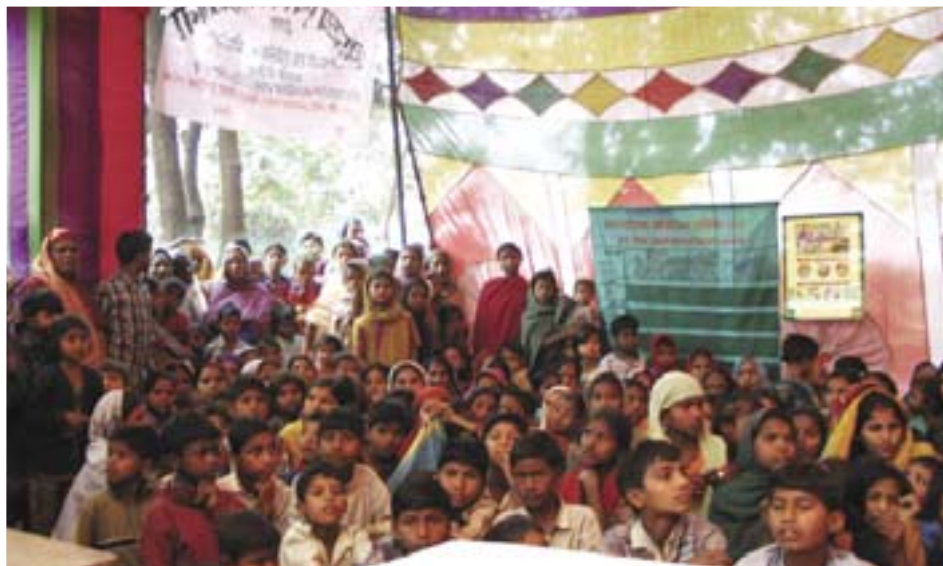
Sharing health messages with the wider community at a village health fair.

In India, more women die of complications during pregnancy and childbirth than from any other cause. Nearly all these deaths are preventable. Many health problems during pregnancy are not recognised or treated because of poor access to healthcare.