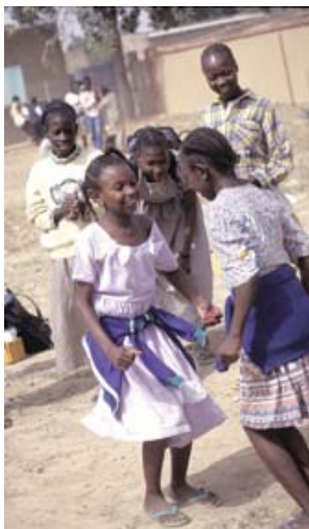
Female genital mutilation puts girls' health at risk.

Female genital mutilation (FGM) is a traditional practice in Burkina Faso and many other countries. It is sometimes called female genital cutting, female circumcision, or excision ( Footsteps 24). It means cutting off part or all of the outer part of a girl's labia and clitoris. Usually the girls are very young and have no choice in the matter.