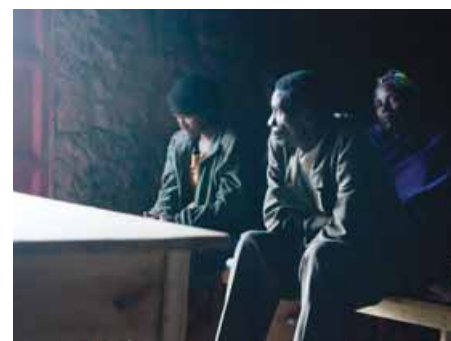
A community meeting in Rwanda.

'I asked the two of them to share the story with everyone. When they told the story, the Tutsi said: "I am alive because of this man". The two men embraced, and the tension in the room was overcome.