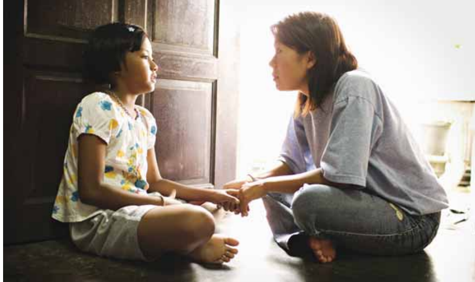
A counsellor helps a child who suffered trauma following a natural disaster.

there is much difference of opinion as to the cause of their suffering, as well as about appropriate treatment. Christian counsellors cannot avoid this debate. Our approach at Oasis Africa considers four aspects: psychological, physical, theological and demonic.