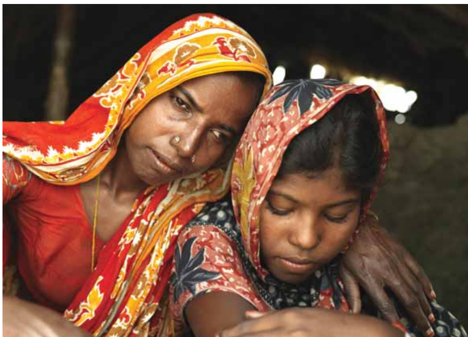
A friend can help by listening and caring without judging.