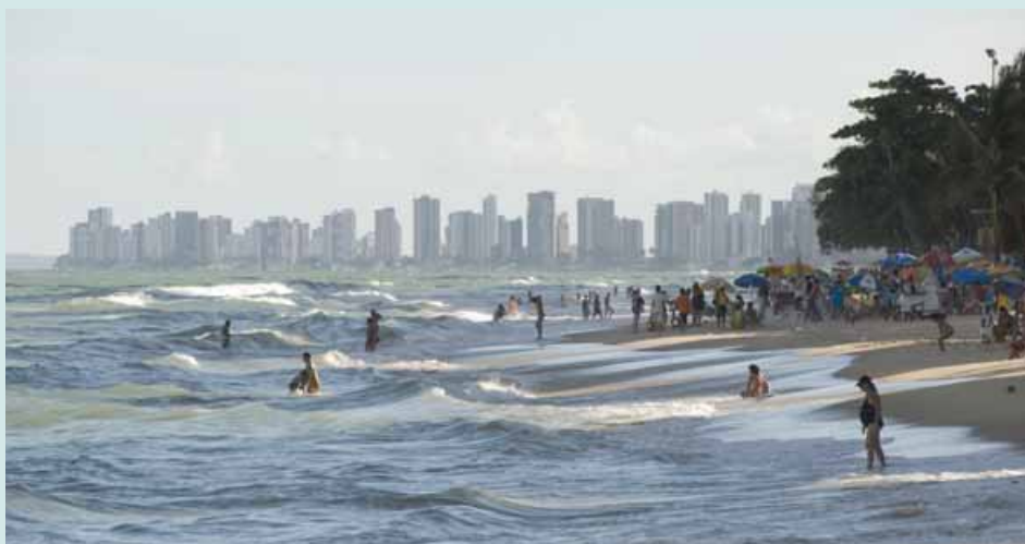
Recife, north-east Brazil.

EDITOR'S NOTE: Calling a child a sorcerer or a witch is against the law in DR Congo. Tearfund partners have been trained in child protection, which includes preventing this abuse and supporting children who may have been stigmatised by it. Footsteps welcomes letters and articles from readers who have experience of how this abuse has been challenged and how children have been reintegrated into their families.