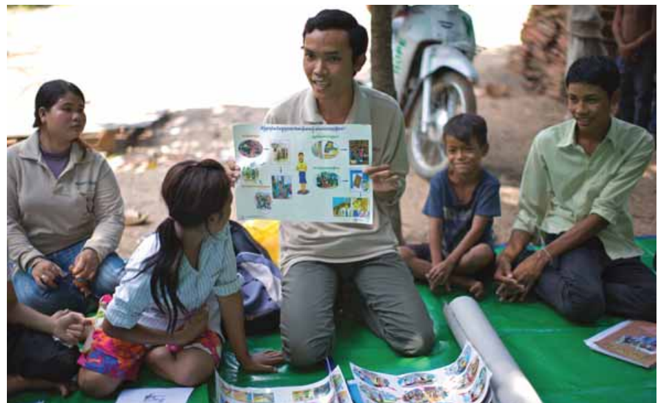
Sharing an anti-stigma message in Cambodia.

The one who stigmatises becomes a victim of stigma in the end. You can't expect to enjoy good relationships with other people if you continue to build walls between yourself and others. You can't expect to stigmatise others without expecting to live in loneliness in the end.