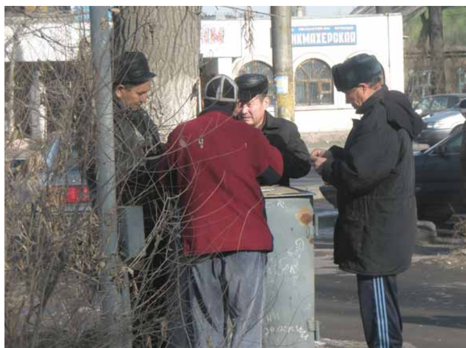
Men meeting on a street in Kyrgyzstan.

Kyrgyzstan is a country in Central Asia. It shares a border with China on its eastern side. The organisation working in Kyrgyzstan was founded by an ex-prisoner who was inspired to help others like him.