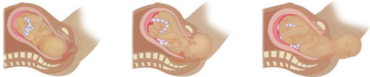
Illustrations by Debbie Maizels © Dorling Kindersley

Stage 2 begins when the cervix is open and ends when the baby is born. This stage is usually easier than Stage 1 and should not take more than about two hours.