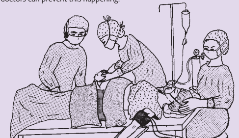
Hesperian Health Guides

When the baby cannot be born through the vagina, an operation called a caesarean section is necessary. The mother will be given drugs to make her sleep without pain (anaesthetic) or she will have an injection in her back so that she does not feel pain below the waist. The doctor makes a cut in her belly and carefully takes the baby out. After the cut is sewn up, the mother stays in hospital for some days to recover. It is then advised that future babies are born in a hospital. A woman can give birth normally after having one caesarean section for a previous birth, but there is a small risk of the womb tearing, which can lead to the deaths of both mother and child. In a hospital, midwives and doctors can prevent this happening.