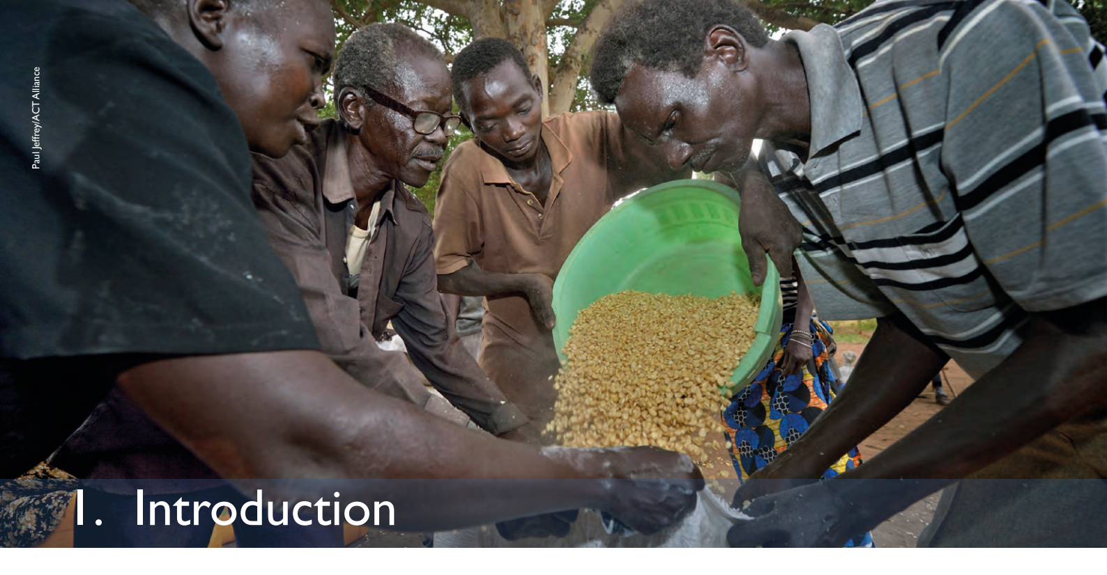
Members of a displaced community pour corn into individual bags during a distribution of food and non-food items to displaced families in Kotobi.