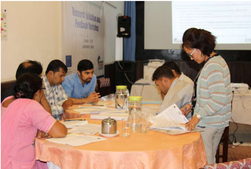
Research validation and feedback workshop – Nepal

The term ‘L/NNGO’ is used throughout the report to reflect the voices of research participants who identified themselves as working or volunteering for local or national NGOs or community-based organisations. Where there were clear differences between what local or national actors were saying, these are highlighted. The term ‘INGO’ is used throughout the report to reflect the voices of research participants who identified themselves as working or volunteering for these organisations and/or reflecting what L/NNGO reflect participants were saying about them. In many cases, Red Cross and Red Crescent societies, United Nations agencies, and even in some cases donor or funding agencies, were called INGOs. Therefore, the terms ‘INGO’, ‘international organisation’, and ‘international agency’ are used inter-changeably in the report, and partnership practice examples and recommendations are relevant for INGOs, Red Cross and Red Crescent societies, and United Nations agencies alike.