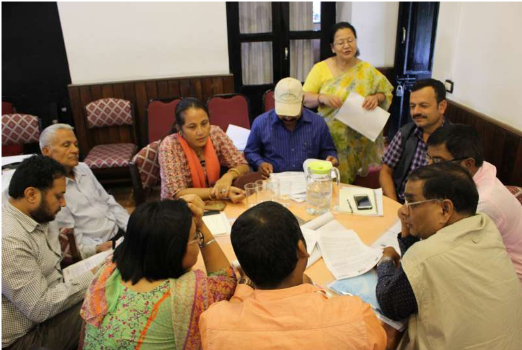
Research validation and feedback workshop - Nepal

Despite those challenges, the research has succeeded in presenting the views and experiences from a rich diversity of NGO voices in Nepal, especially from local and national NGOs, whose voices are often not heard clearly enough in research conducted by INGOs. The research provides valuable insights into partnerships and beyond that can assist all humanitarian stakeholders in designing and co-creating strategies to accelerate localisation of humanitarian action.