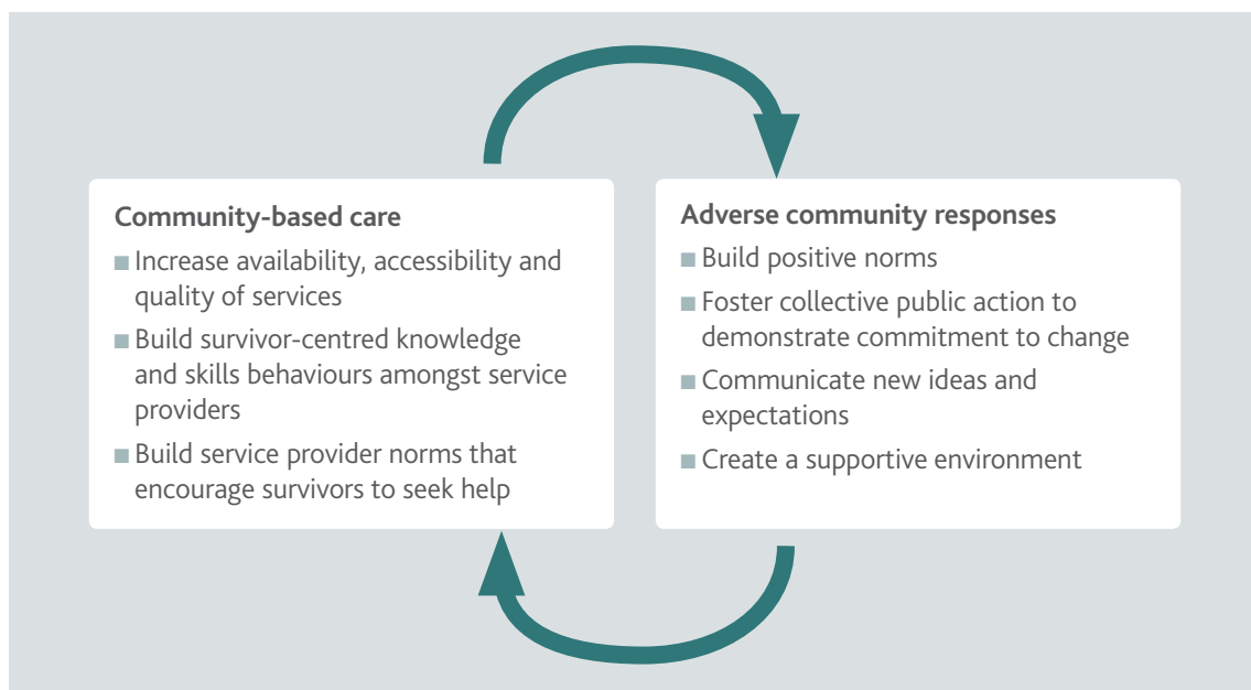
Figure 2: Communities Care: Transforming Lives and Preventing Violence Programme (UNICEF 2015)