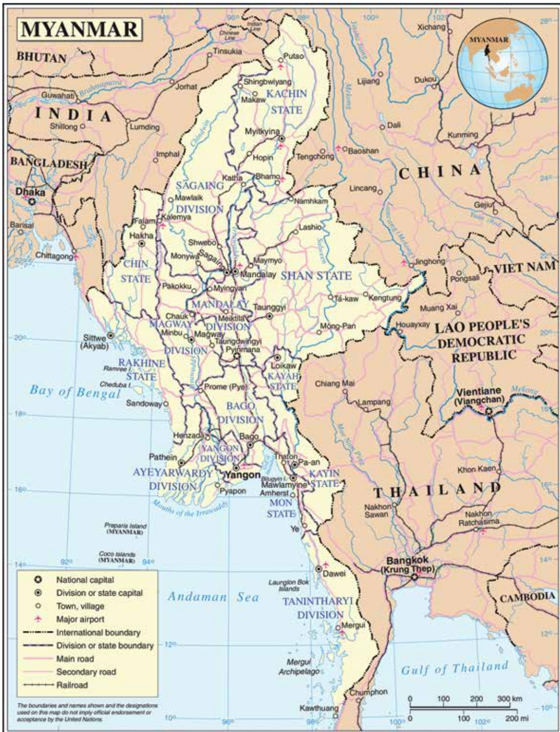
Map of Myanmar (United Nations)

Myanmar has a pluralist and complex society with over 100 different ethnic groups. The majority of the population adhere to Theravada Buddhism, followed by Christianity (Roman Catholics, Anglicans, and other small Protestant denominations), Islam (mainly Sunni), Hinduism and animism. 10-12